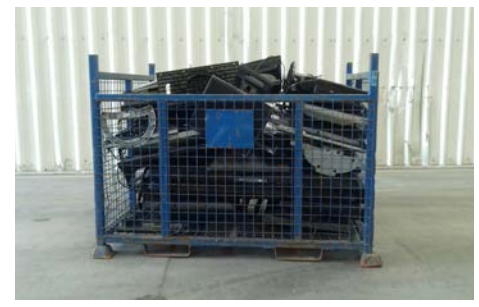
Televisions and monitors in WEEE cages