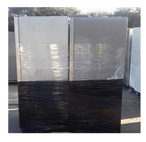
Fridge Freezers shrink-wrapped to wooden pallet

Refrigerant media typically found in fridges, freezers, air conditioners, dehumidifiers, etc. can leak from appliances if damaged, harming the environment and causing skin or eye irritation as a result of direct contact with the rapidly evaporating refrigerant. When being presented for collection, appliances must be free of any contamination e.g. foodstuff and packaging. Take care to protect the exposed rear wire condenser on the back of fridges and freezers stack these appliances facing frontwards so that it is not possible to grip the appliance by the condenser on either side. Appliances should be shrink-wrapped securely to a wooden pallet as pictured. If stacking is required, ensure it is done so heaviest at the bottom, lightest at the top to prevent damage.